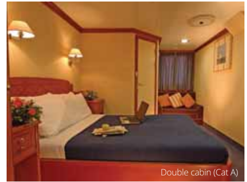
Double cabin (Cat A)