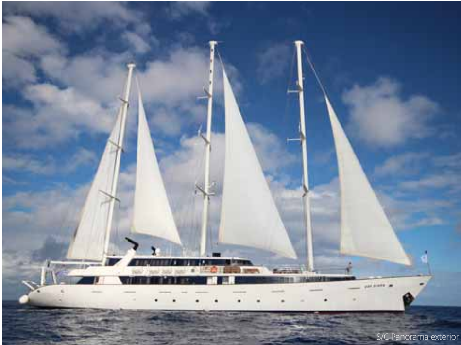
S/C Panorama exterior