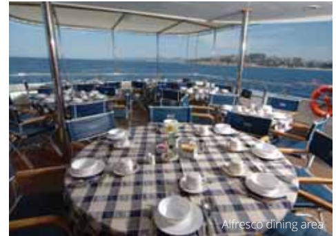
Alfresco dining area