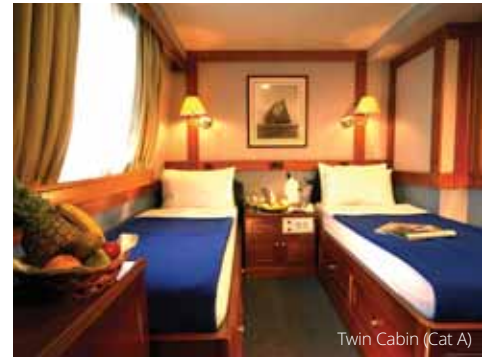
Twin Cabin (Cat A)