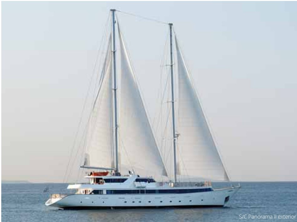
S/C Panorama II exterior